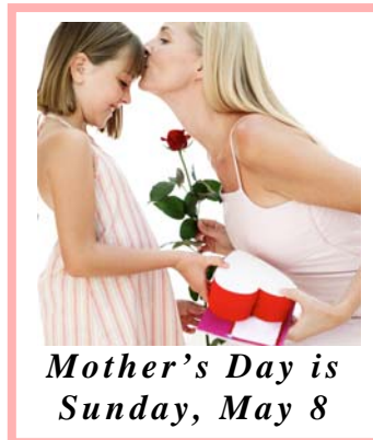
Mother's Day is Sunday, May 8

The midweek get-togethers to discuss the week's readings from our Reading the Bible in a Year emphasis will happen on Wednesdays. You can choose between a meeting at 11:00 am or 7:00 pm on Wednesdays throughout the coming year. Come discuss what you are reading in the Bible in a non-threatening atmosphere!